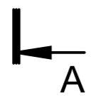
Pogled X - Priključni ormarić, položaj uvodnica View X - Terminal box, cable gland position