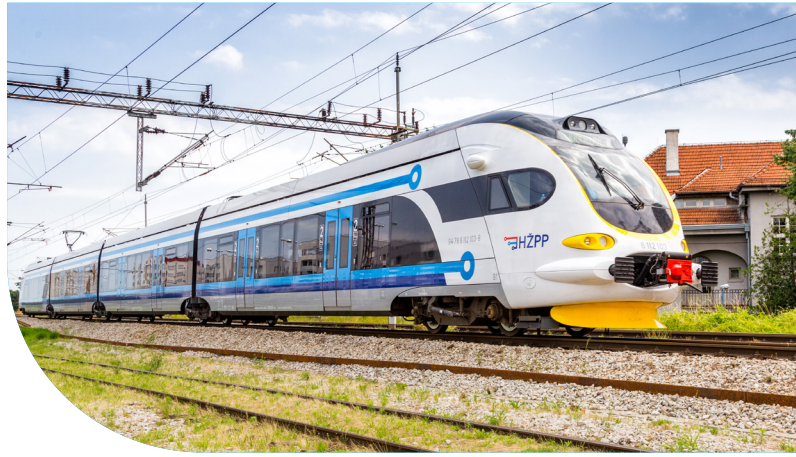
KONČAR electric multiple unit for Croatian Railways